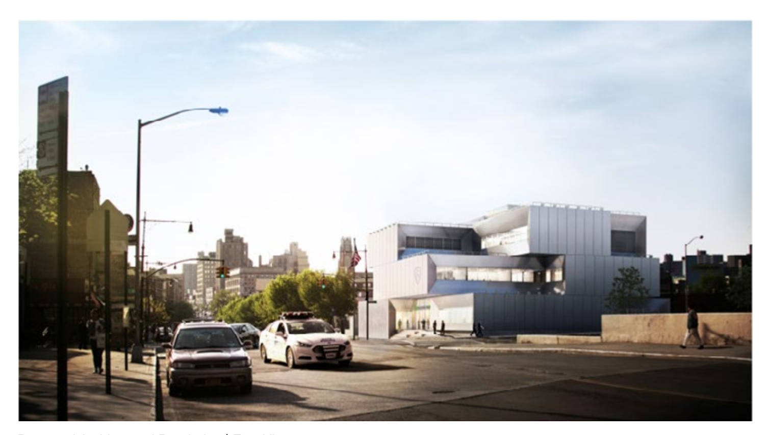
Proposed Architectural Rendering | East View