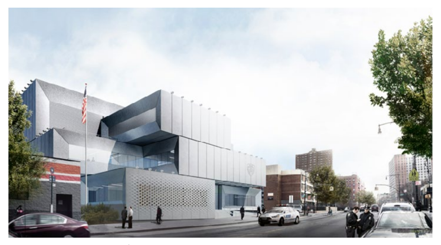
Proposed Architectural Rendering | South-West View