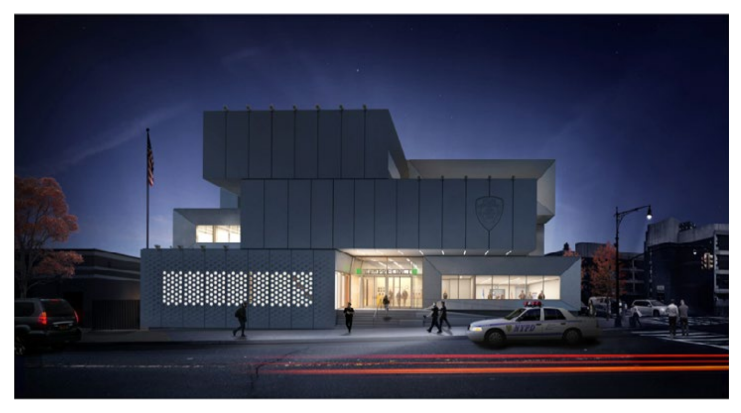
Proposed Architectural Rendering | South View at night