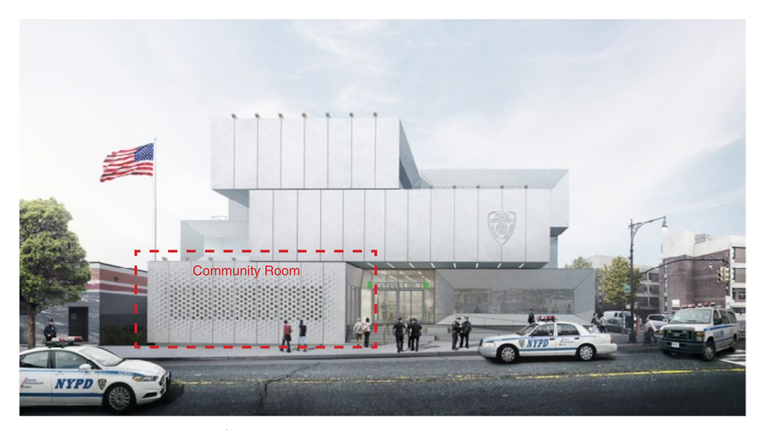
Proposed Architectural Rendering | South View indicating Community Room